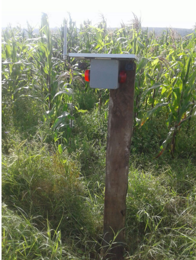
Collar-activated alarm system.

Protecting elephants to conserve the greater Mara ecosystem www.maraelephantproject.org