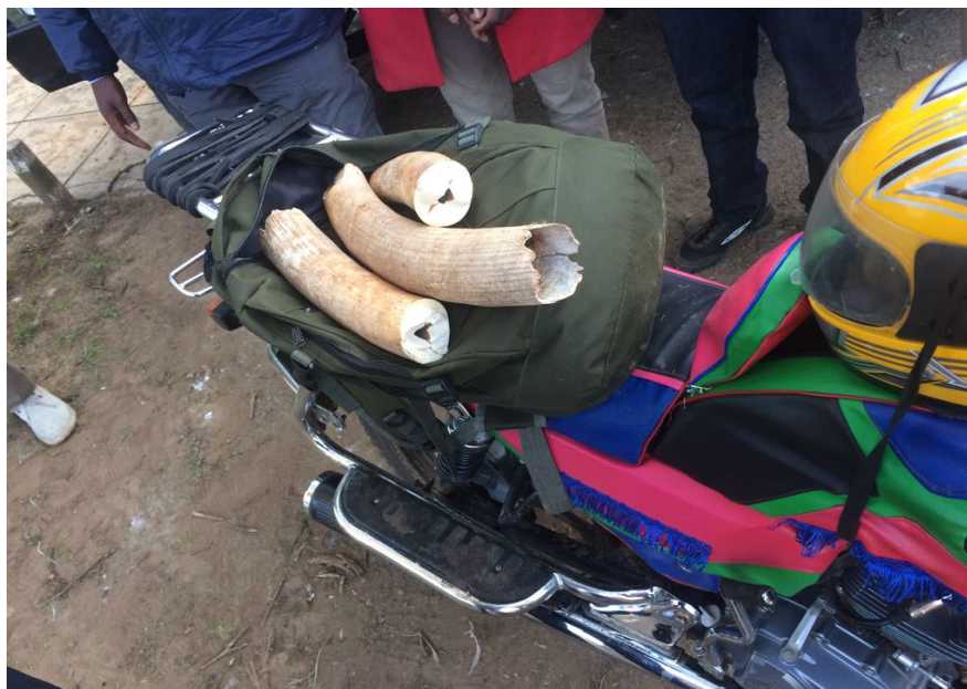
The KWS arrested three suspects in Narok with 4 kg of ivory based on MEP intelligence.