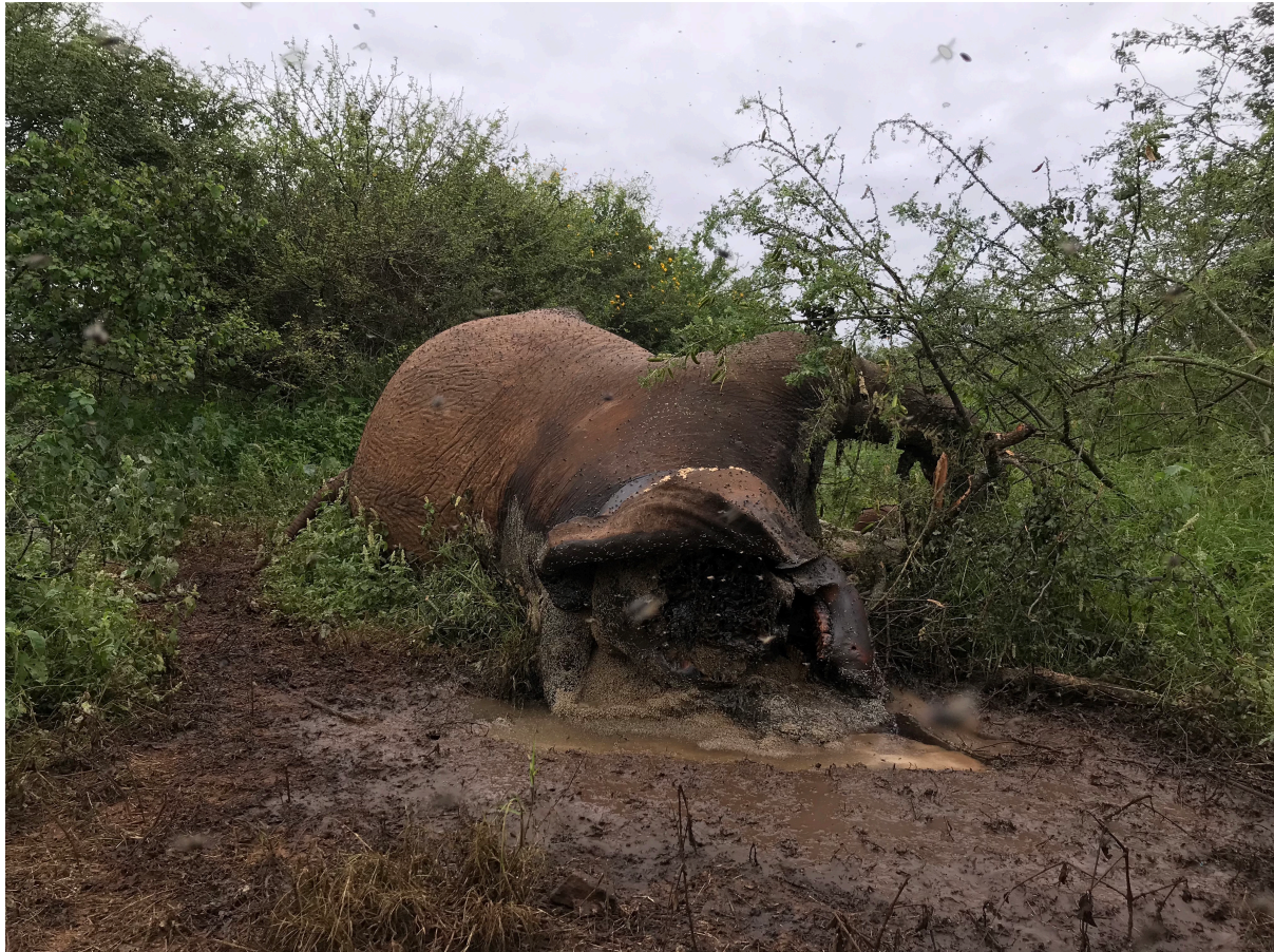
Elephant carcass in Ngrumani Loita suspected to have been poached.