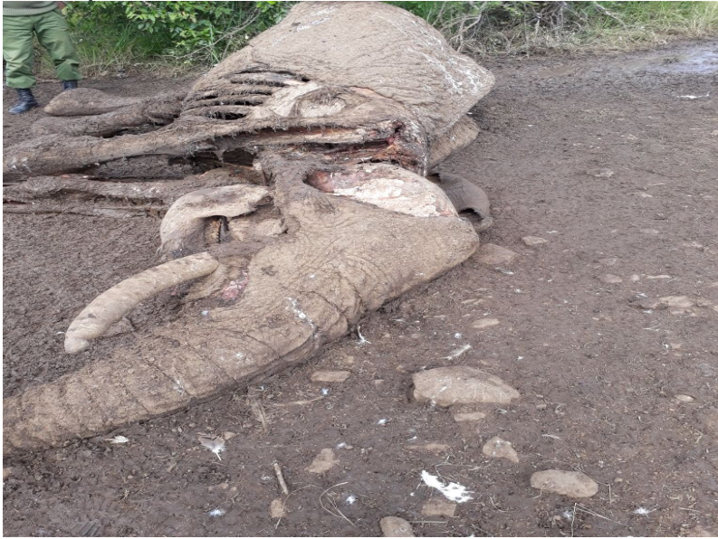
Two elephant carcasses were reported in Naboisho Conservancy and the cause of death was unknown due to the decomposition of the carcasses.