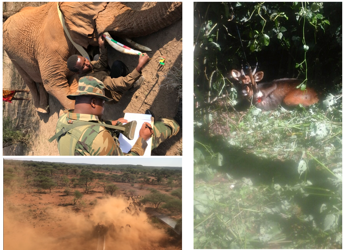
Collaring Earhart on the 8<sup>th</sup>. Thick dust hiding the herd. Right: Bushbuck caught in a wire snare in the Mau Forest.