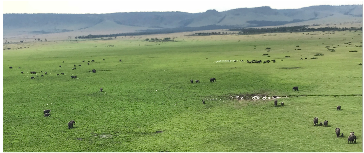
Elephants in the Mara Conservancy peacefully grazing.