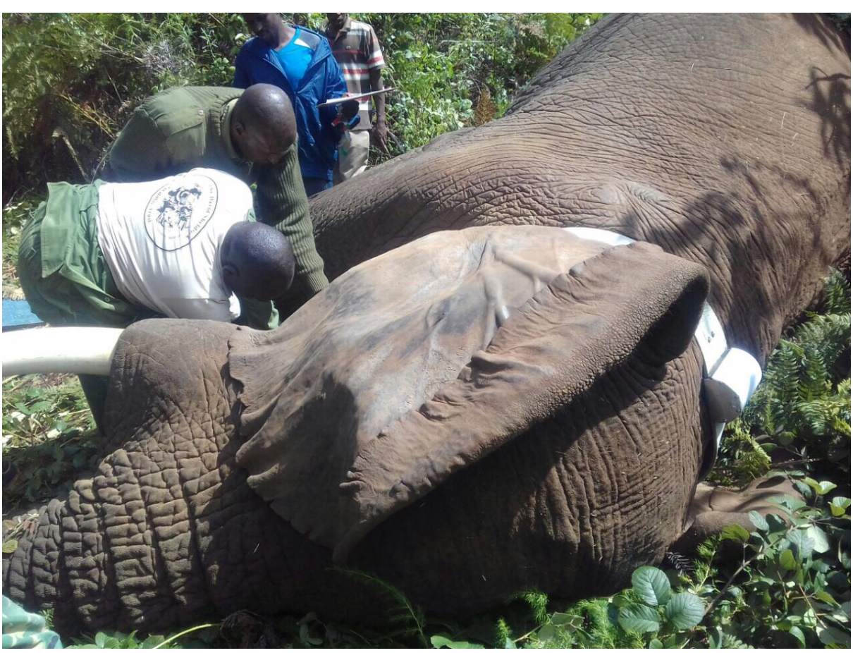
Collaring Wilber in the Mau Forest.