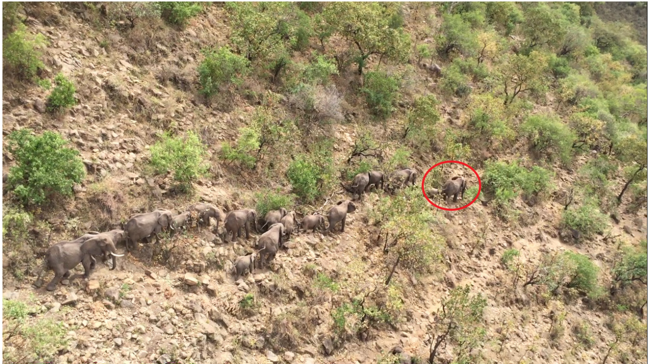
Hangzhou leading her herd of 16 elephant back down the Oloololo Escarpment on the 3 rd of August. The collar data indicated she was going close to farms and we were able to react before they started crop raiding.