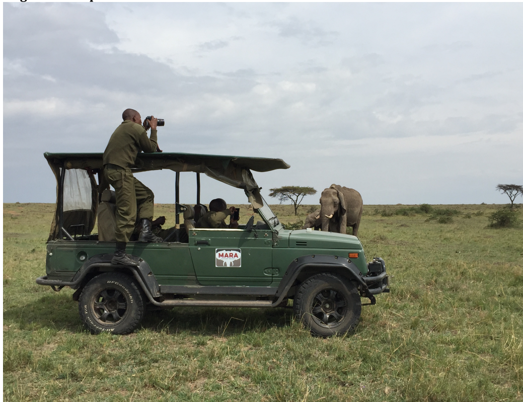
Rangers viewing Courtney shortly after she was treated in the Musiara area.