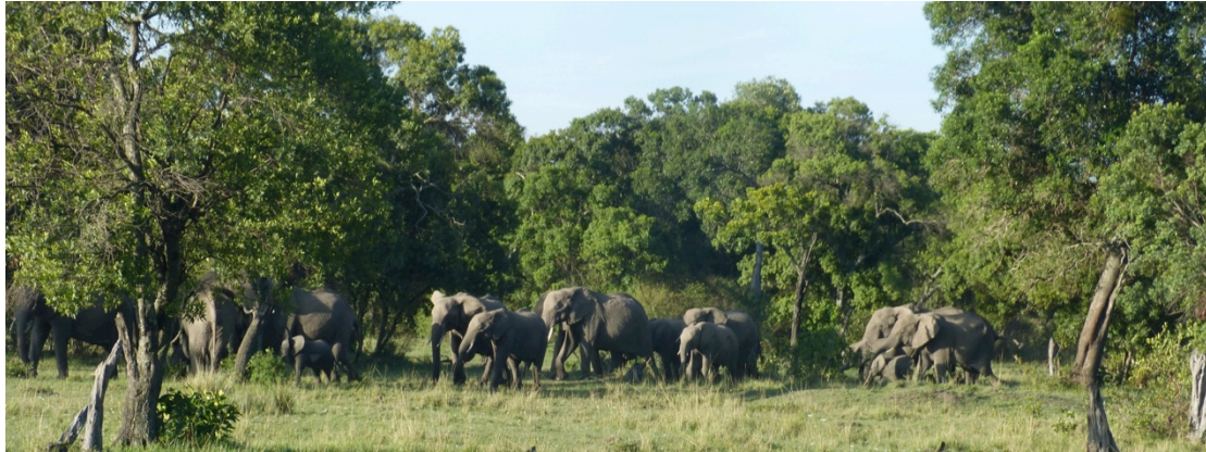
Elephants peacefully grazing on the MEP/Tracks Trust property in Lemek Conservancy