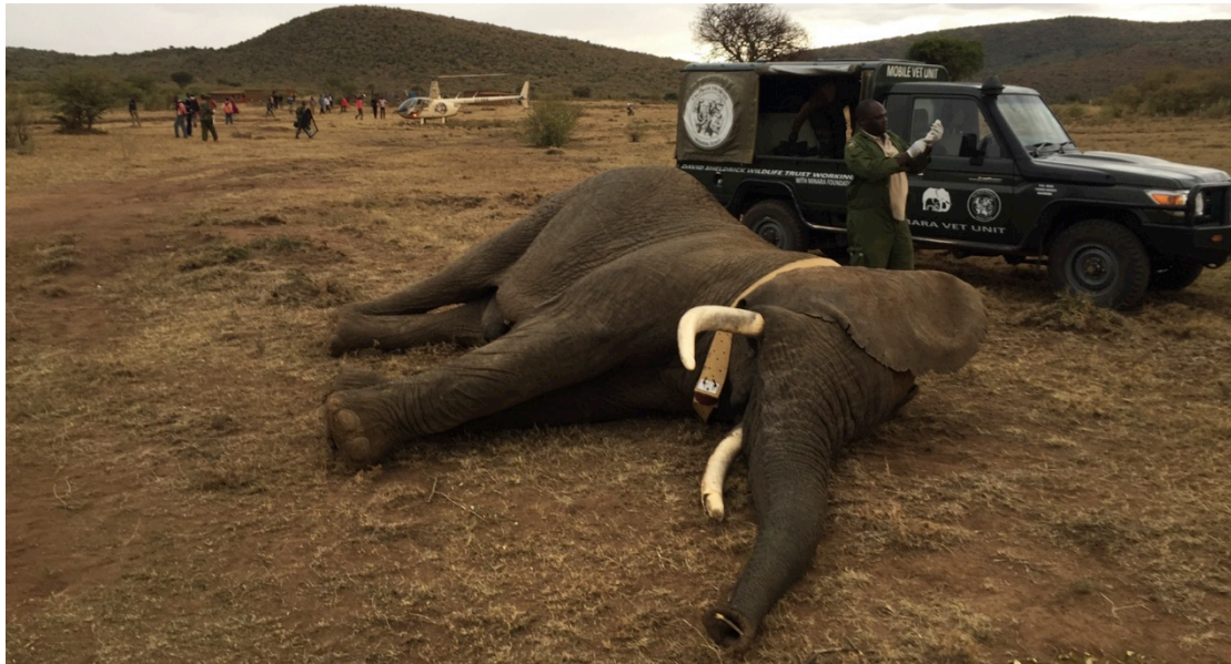
Collaring Elephant Olchoda

This is the first period we have started the aerial patrols in earnest. Each month we will visit each of the 21 collared elephants, bar the ones in Tanzania- so 19 in total. During these flights we will be completing the STE Aerial Monitoring form and filling these in the MEP scientific Drop box folder. The tracking flights have been extremely helpful to also check the general conditions of the various herds. It has been interesting to also see the herd structure changes between each flight. On the 29 th of October we collared elephant "Courtney" after she was wounded by 11 arrows in Ologolin. We also collared a HEC candidate in the Pardamat area who the community has been complaining about for some time; his name is Olchoda "The Disturber".