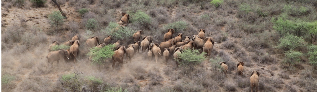
Elephant Santiyan and her herd during the first aerial monitoring flight.

The single most exciting news about the helicopter is that Mrs. Sue Anschutz-Rodgers donated 35,000USD to the helicopter account for operations. We have also been furnishing once per month aerial tracking flights of all the collared elephants. We took the helicopter to Nairobi for KWS to conduct the 300hr service. We also did a track and balance of the blades and she is flying much more smoothly. The hanger building has started and we expect the foundation to be completed in December. The helicopter has transformed our ability to respond to HEC, and other emergencies, effectively over a very large area.